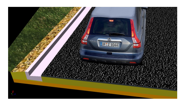
Trimeshes are coming...