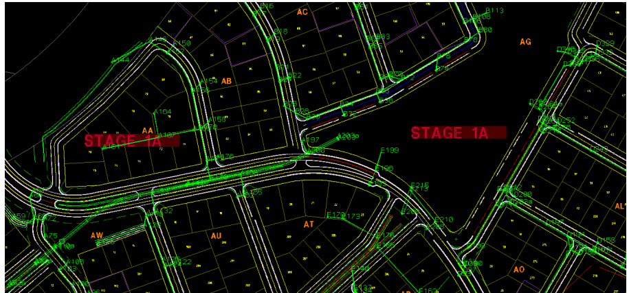
Numbered stormwater in 12d Model, after running import